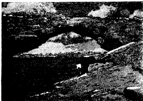
ON ABACO ISLAND.

Alas that such a charming people should have been expatriated, and that in the process of evolution so little progress has thus far been made in reproducing their like! The negroes have something of their spirit, and as their blood is gradually giving a warmer and warmer coloring to that of the whites, a race such as Columbus admired may again people these