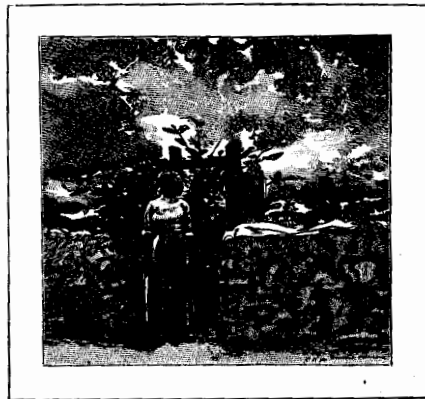
A NASSAU GATEWAY. (SKETCH OWNED BY E. W. HOOPER.)

The walls that border them are built of the