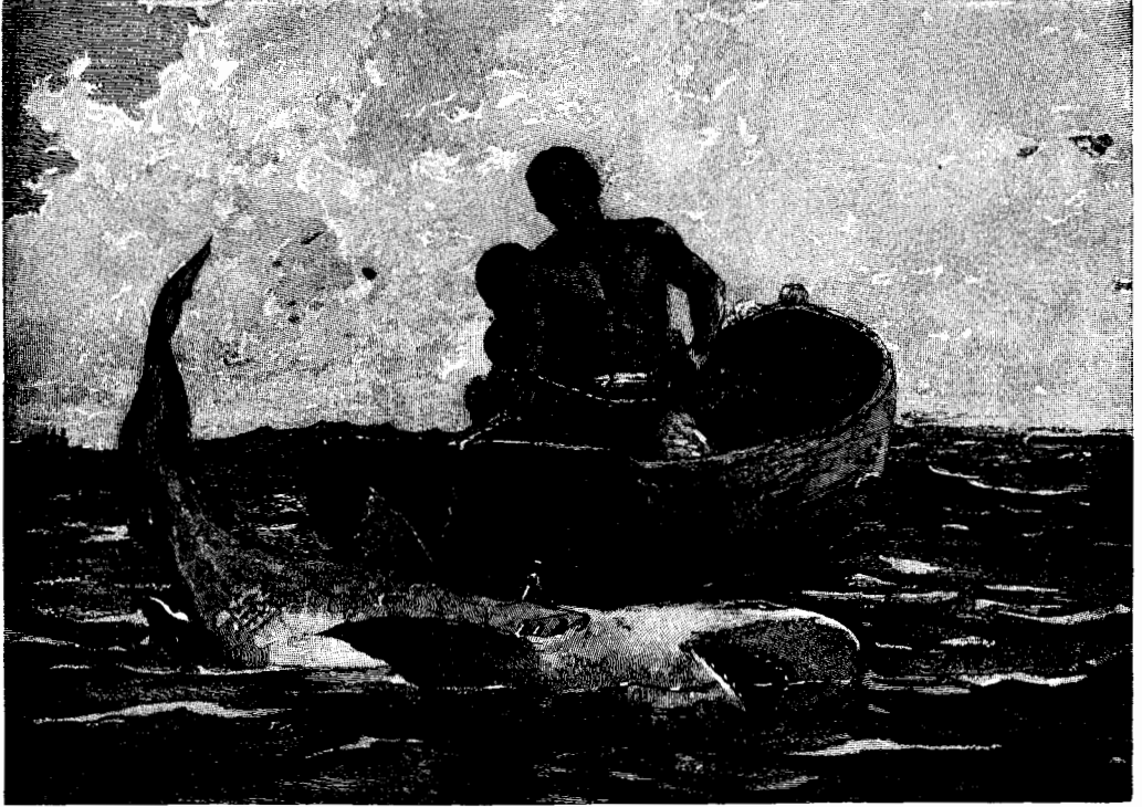
SHARK-FISHING — NASSAU BAR.

on the surface that the roots of plants and trees penetrate in all directions, seeking the fresh water stored up in its crevices, and resting upon the sea-water which is found below it. Andros Island is the only one of the group that has any pure water, except what is stored in tanks after a rain. The water of the shallow wells in Nassau is brackish, and rises and falls with the tide.