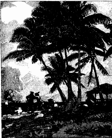
A GROUP OF PALMS.